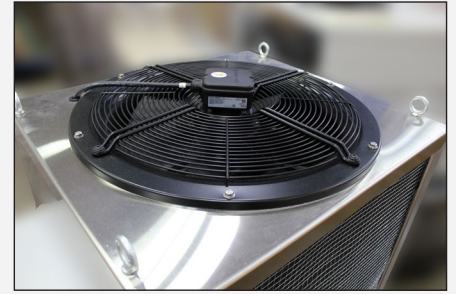
A-Series chiller from top.