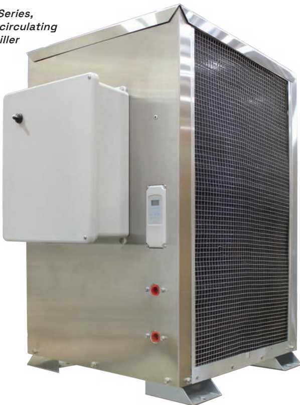
A-Series, Recirculating Chiller

Chillers are accessories or ancillary units to industrial equipment, sometimes integrated into the OEM equipment or sold as a package. Our OEM partners know that our Koolant Coolers brand chillers provide reliable cooling to protect the overall equipment efficiency. The robust craftsmanship is fully tested in-house, designed with name-brand components, backed by a 18-month warranty , and coupled with 24/7 phone support and field service technicians . This provides OEMs confidence that partnering with a Koolant Coolers brand chiller maximizes uptime through investment in upfront design.