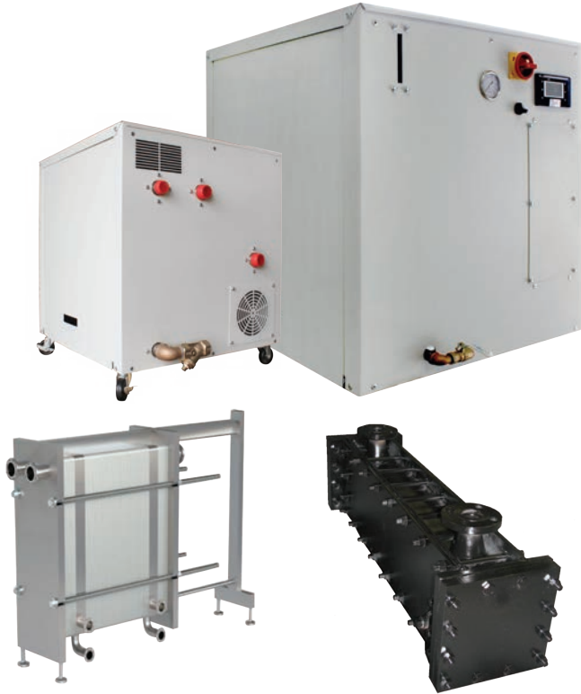
Dairy Heat Exchanger