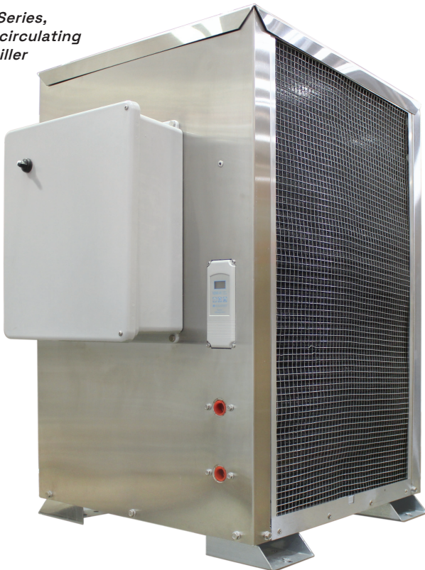
A-Series, Recirculating Chiller

Chillers are accessories or ancillary units to industrial equipment, sometimes integrated into the OEM equipment or sold as a package. Our OEM partners know that our Koolant Coolers brand chillers provide reliable cooling to protect the overall equipment efficiency. The robust craftsmanship is fully tested in-house, designed with name-brand components, backed by a 18-month warranty , and coupled with 24/7 phone support and field service technicians . This provides OEMs confidence that partnering with a Koolant Coolers brand chiller maximizes uptime through investment in upfront design.